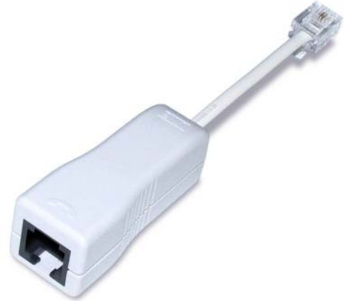
Z-301LS In-Line xDSL over POTS Filter

The Z-301LS is a small in-line filter designed to expedite the service delivery and improve the performance of digital subscriber line (DSL) and home phoneline network (HPN) services. This model filters all telephone sets, facsimile machines, answering machines, etc individually or in groups on line 1 only. Our in-line DSL filter design electronically isolates the high-speed DSL and HPN data streams from the voice band plain old telephone service (POTS). This design effectively blocks the DSL, and HPN up to 30 Megahertz.